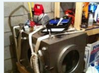
Arrest in Bethlehem chemical find