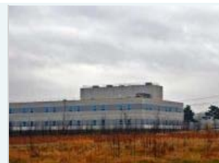
Did atomic air escape?