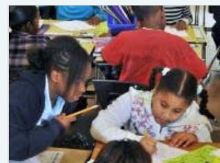
Albany public schools try ads