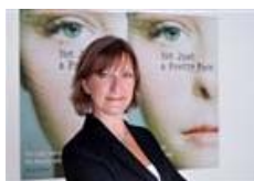
Get the lead out ... of your lipstick