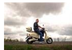
'Cheap as chips' electric bikes

Home News Opinion Business Sports Entertainment Life Health Technology Travel Jobs Cars Homes