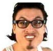
Don't be 'that guy'