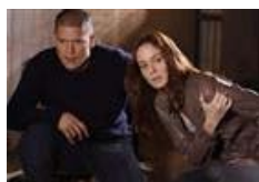
Prison Break finale