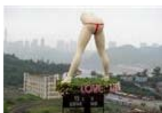
Adult park gets Chinese talking