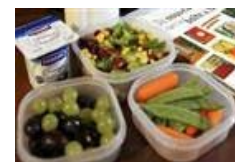
Menus with calorie counts may help fight childhood obesity