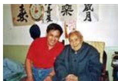
China's last eunuch