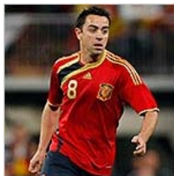
Xavi Is Spain's Maestro of the Midfield