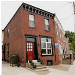
What You Get For ... $275,000