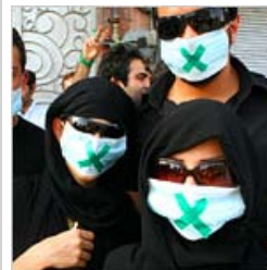
Room for Debate: Social Forces Unleashed in Iran