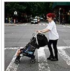
City Seeks New Powers Against Homelessness