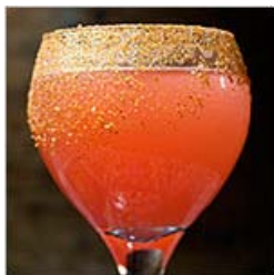
A Guide to Bartending With Frost on the Glass