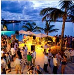
36 Hours in Bermuda