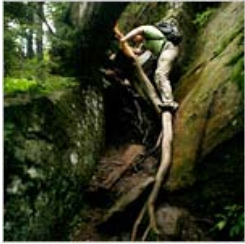
2 Days, 3 Nights, on a Path Named for a Devil