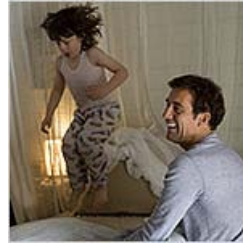
A One-Parent, No-Rules Household