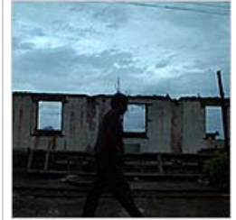
The Serious Regard for Cinema